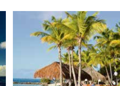
SAIL THE TREASURE ISLANDS FROM ST MAARTEN